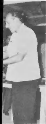
receives Govern- ing Lt. Governor largest fish.